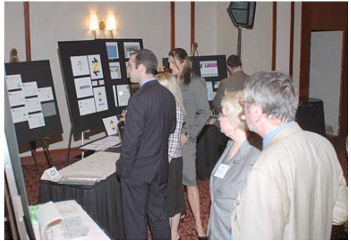
Spring Meeting attendees view some of the 2004 student design projects.

visibility for an international piracy project. Partners included UMass, Babson, Boston University, Northeastern University, and Olin College.