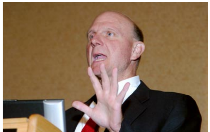
Microsoft CEO Steve Ballmer gets up close and personal with the crowd at the Fall Membership Meeting.