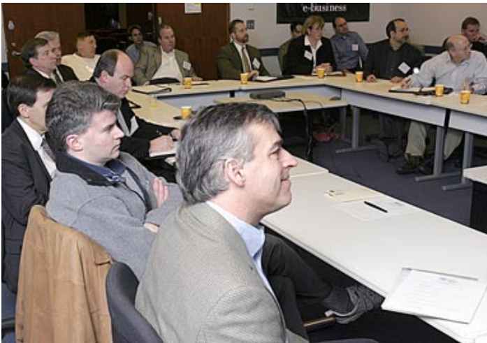
A rapt audience listens to a marketing case study presentation at the February Sales & Marketing Roundtable.